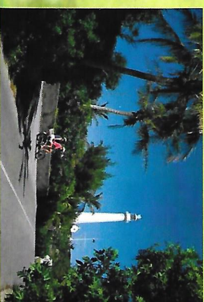
King's Wharf: Gibbs Hill Lighthouse